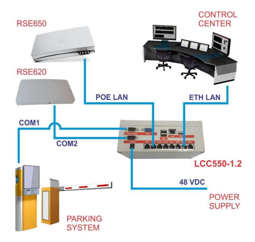
Parking facility access control integrated via LCC550 Universal parking controller