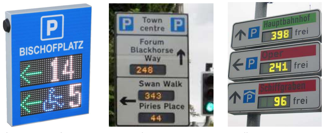
Composite VMS displays presenting free parking capacities in refferent surrounding