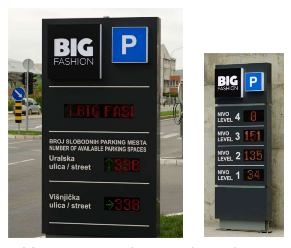
PGS summarized information for the facility and its different leveles